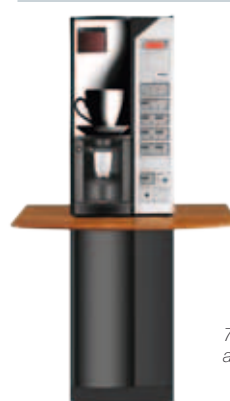
7100 with base cabinet and worktop

Base cabinet · Worktop in mahogany · Water tank (for base cabinet, 20 litres) · Hygiene kits · IRDA kit · Mechanical counter · FB cream kit.